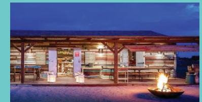
RUM SHED BAR & GRILL