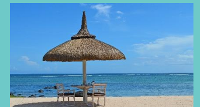
STARS ON THE BEACH – FEET IN THE SAND