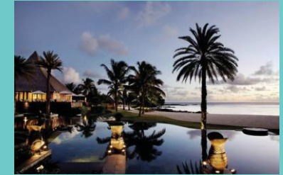
STARS RESTAURANT – FINE DINING