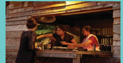
LA KAZE MAMA – AUTHENTIC CUISINE